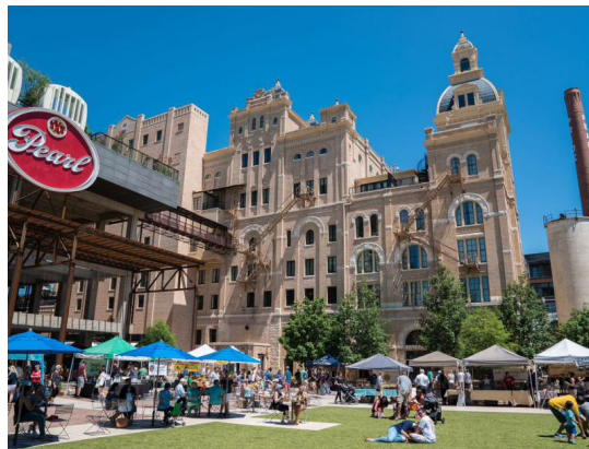
Pearl Dining and Entertainment Center