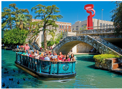
San Antonio's famous Riverwalk