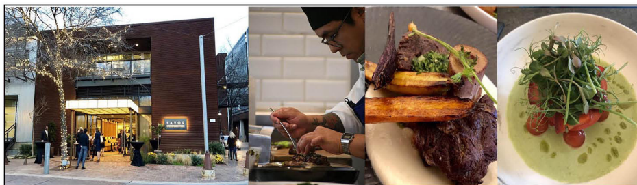
Savor Student Restaurant

For a clickable link to San Antonio tourist information, visit the ACPC web site at http://www.polishcultureacpc.org/Conv_2022/