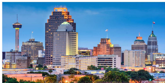
Beautiful San Antonio