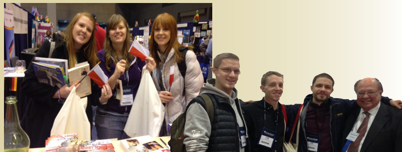
Through the Polish Perspectives Program, young American educators such as these receive important materials on Poland and Polish cultural and historic achievements.

- The ACPC continues to advocate for the recognition of the Polish contributions to the Jamestown settlement in colonial Virginia. We dedicated an Historical Marker in Jamestown Virginia to commemorate the arrival of the first Poles there in 1608 and the first industry in the New World—glassmaking. We continue to promote the historic accomplishment of the first successful work stoppage in the New World in 1619 led by the Poles for the right to vote.