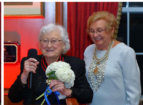
2021 ACPC Awardees