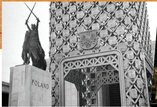
Facade and old color post card of 1939 Polish Pavilion