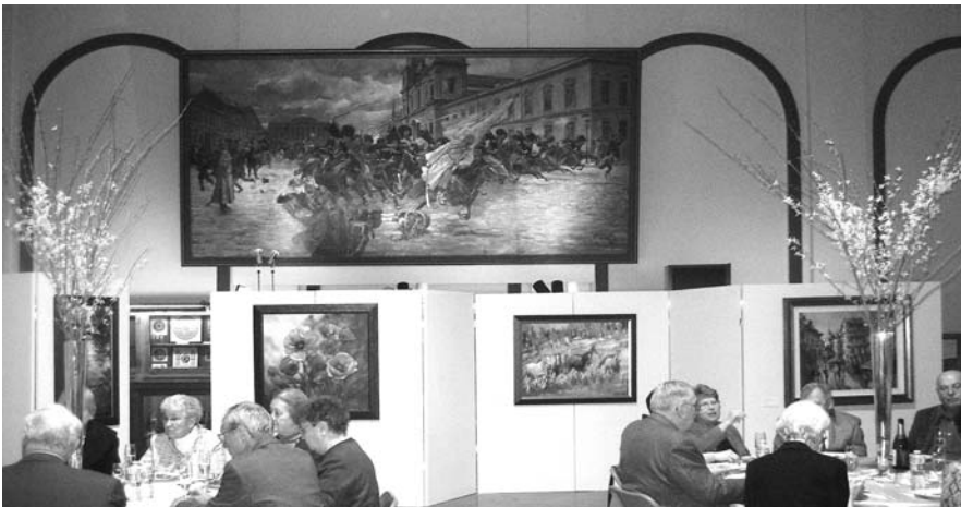
Attendees at the luncheon - Polish Museum