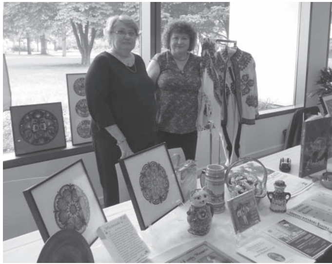
Polish Heritage Society of Philadelphia