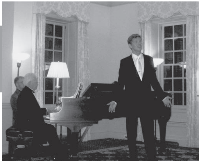
Above: Polish Tenor Andrzej Stec performing on July 19.