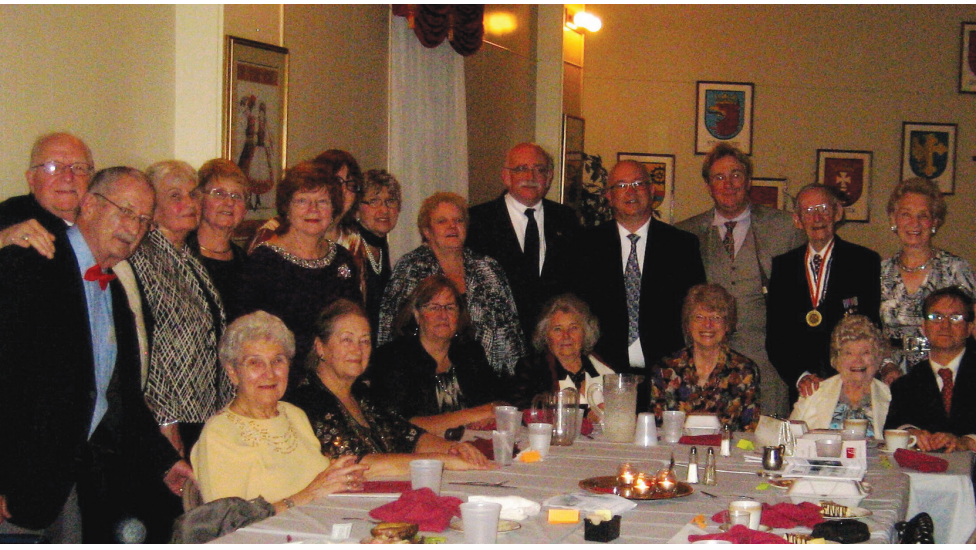
Above: ACPC directors enjoy the 95th Anniversary Banquet at the Syracuse Polish Home.

Congratulations on excellent events to the Syracuse Polish Home group and the Syracuse Polish Heritage Club. STO LAT and then some more!