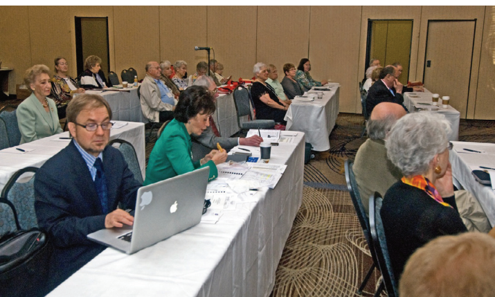
Left: Convention delegates during one of the working sessions.