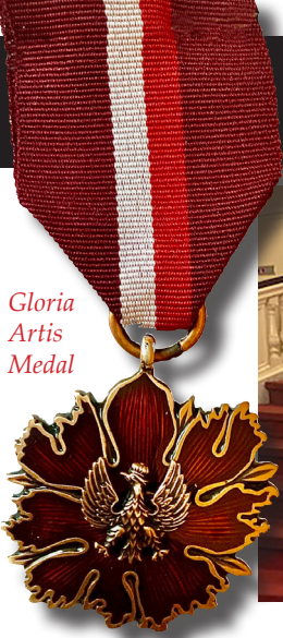
Gloria Artis Medal